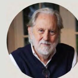
Lord David Puttnam President, NFTS

Lord David Puttnam