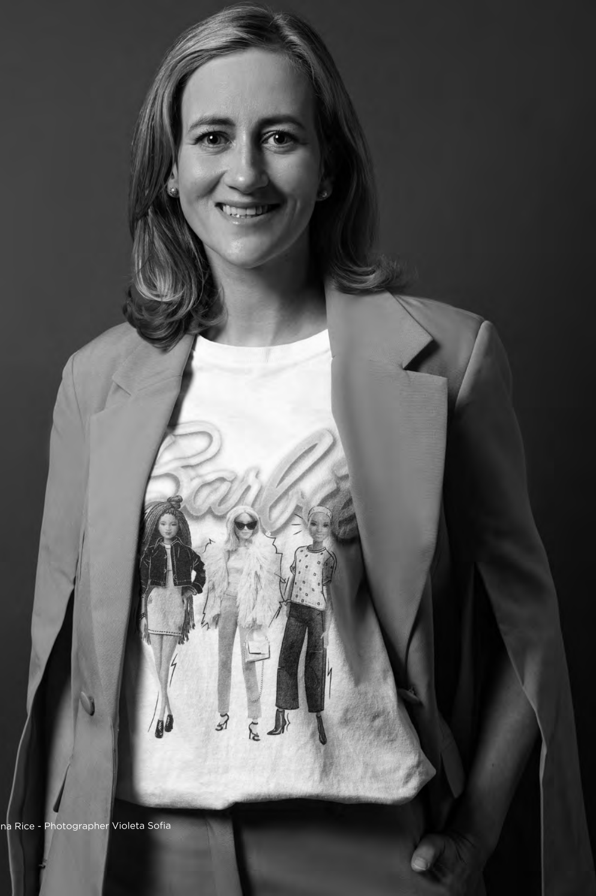
Nina Rice